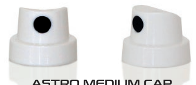
ASTRO MEDIUM CAP High Output Clean Stroke